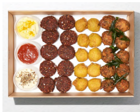
Vegan and Low Gluten Bites Platter ($110)