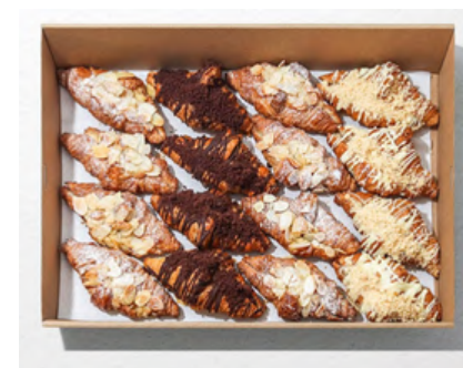
Sweet Croissant Platter ($85)