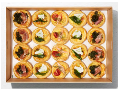
Mini Quiche Platter ($97)

Please note hot platters are only available for delivery from 10am to 5pm