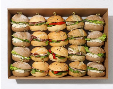
Mini Slider Platter ($95)