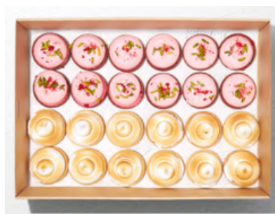
Mini Dessert Platter ($85)