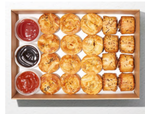
Mini Pie and Sausage Roll Platter ($97)