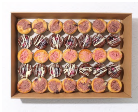
Mini Muffin Platter ($85)