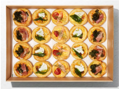
Pizza Platter ($85)