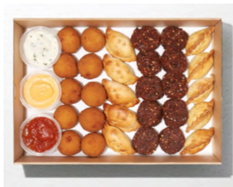
Vegetarian Bites Platter ($97)