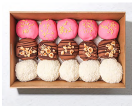
Mini Doughnut Platter ($85)