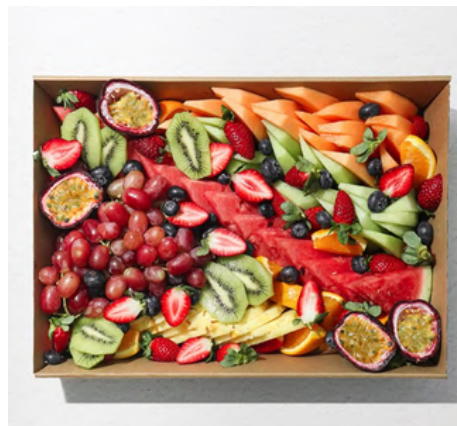
Seasonal Fruit Platter ($85)