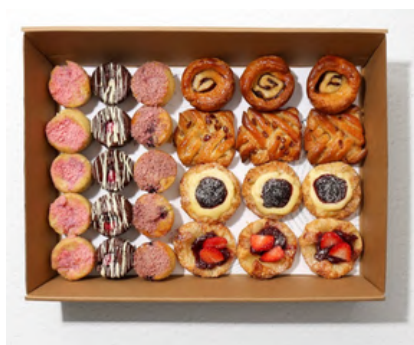
Classic Pastry Platter ($85)