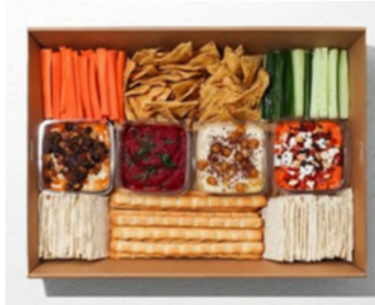
Turkish Bread and Dips Platter ($85)