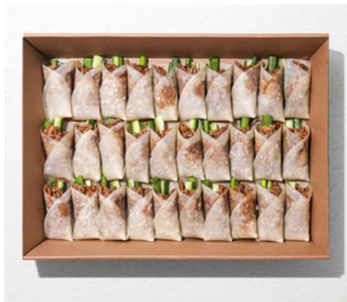
Duck Pancake Platter ($135)