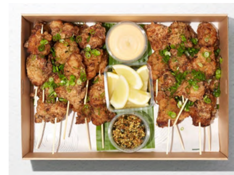
Karaage Chicken Skewer Platter ($125)