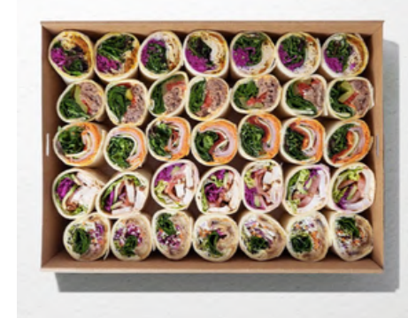
Mini Wraps Platter ($85)