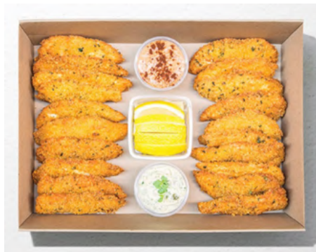
Chicken Bites Platter ($97)