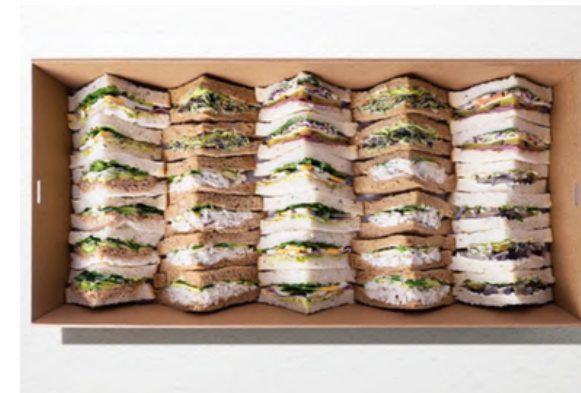
Sandwich Platter ($85)