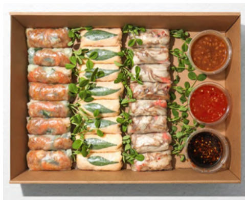
Combination Rice Paper Roll Platter ($120)