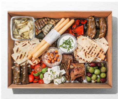
Mediterranean Mezze Platter ($85)