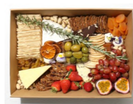
Cheese Platter ($85)