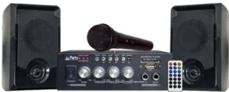
Karaoke system (available on request, not always onboard)