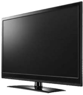
32" Flat screen TV

We have the following audio visual equipment available onboard: