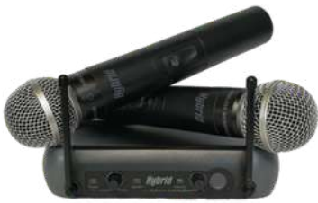
2 X wireless microphones (available on request, not always onboard)